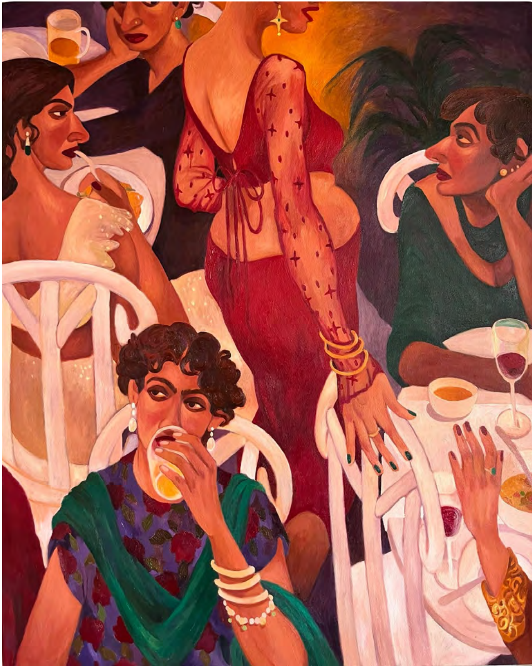
Aksh Diwan Garg Is this seat taken 2025 Oil on canvas 40 x 50 inches