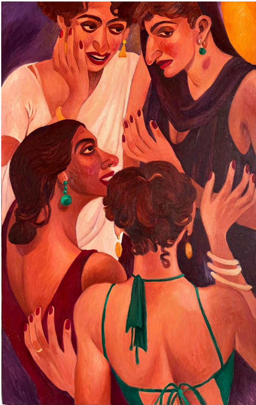
Aksh Diwan Garg Mosquito bite 2025 Oil on canvas 24 x 38 inches