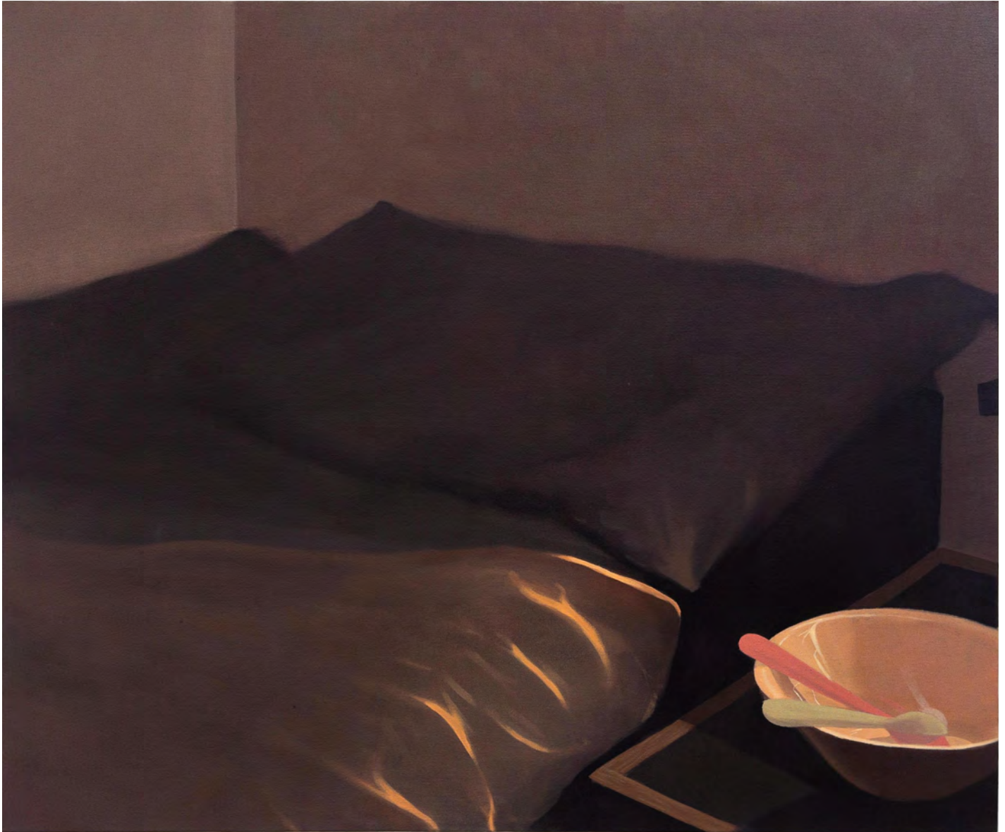
Lakshya Bhargava Morning Bed 2025 Acrylic on canvas 36 x 30 inches