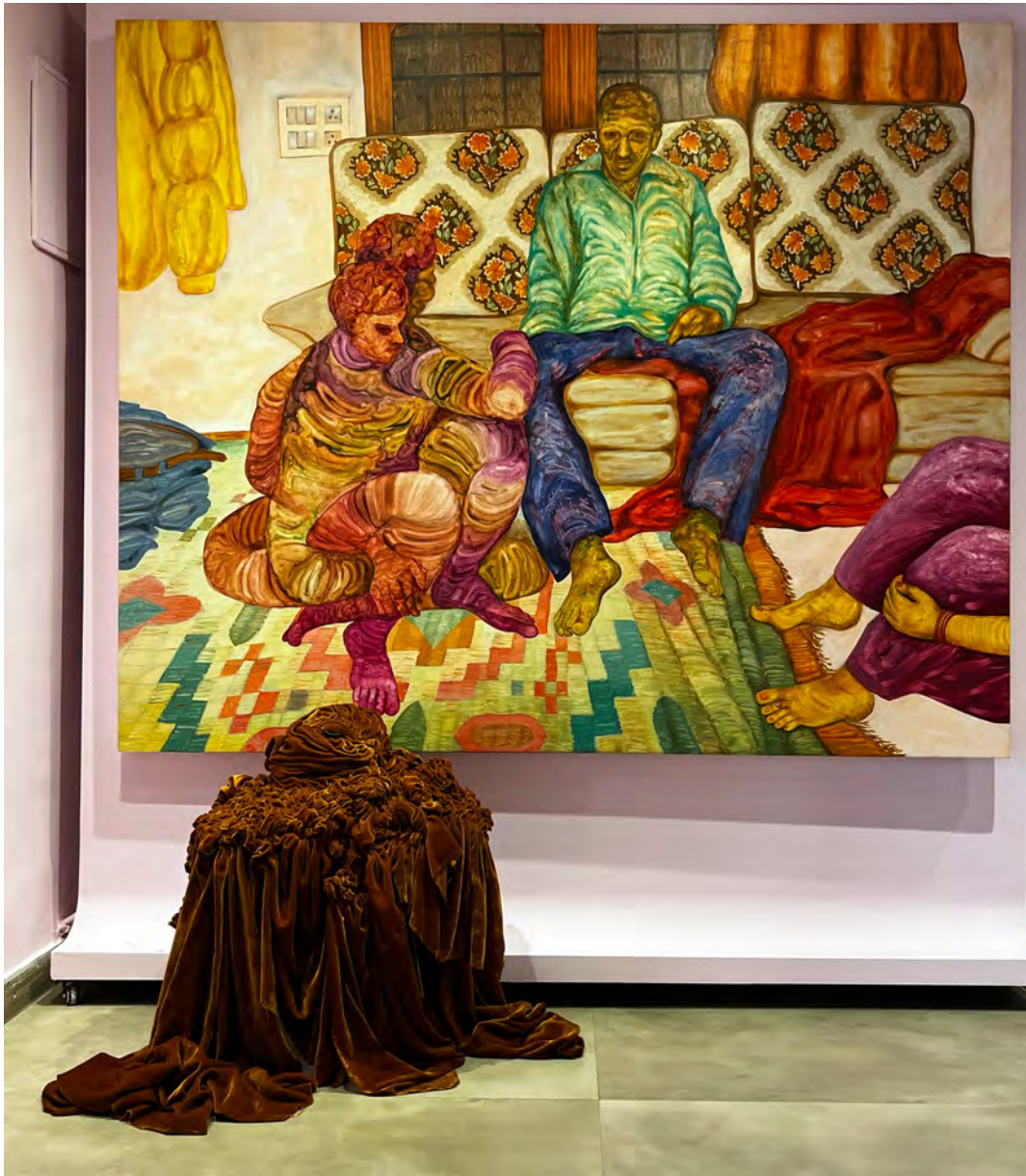
Deepak Dhiman Outcome-ing / shredded skin 2025 Mixed media on canvas + velvet sculpture 60 x 72 inches