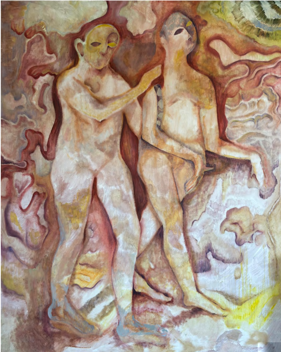
Namrata Arjun Arrival (after masaccio) 2025 Oil on linen 60 x 48 inches