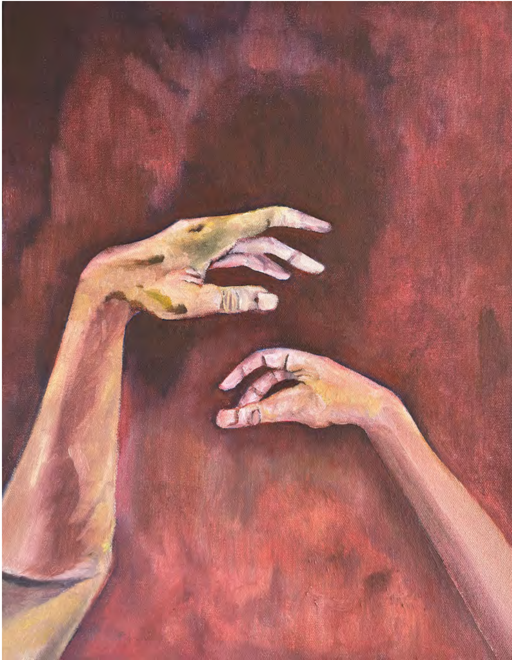
Namrata Arjun Neuroqueering 2025 Oil on linen 18 x 14 inches