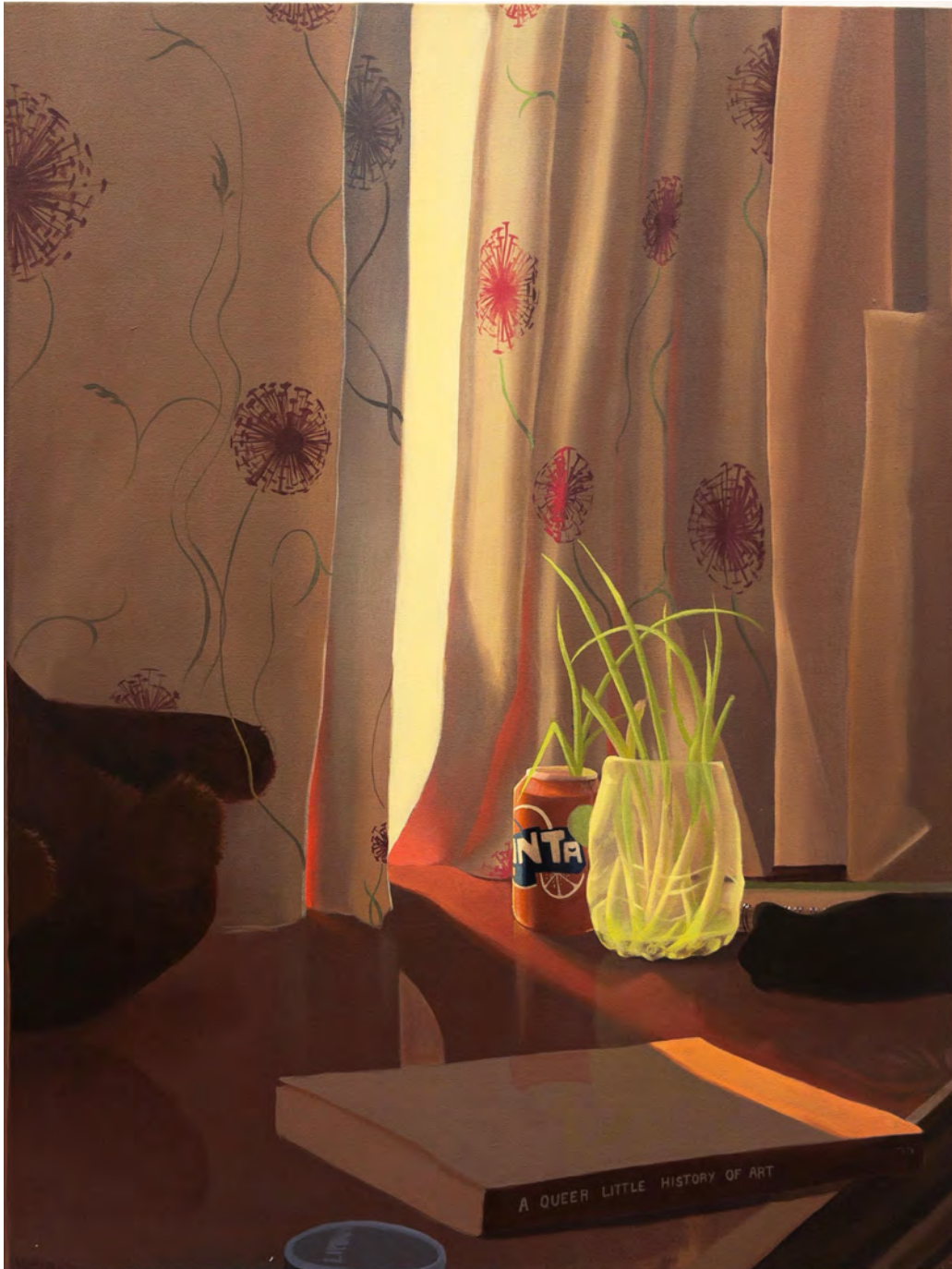
Lakshya Bhargava Spring Onions 2025 Acrylic on canvas 36 x 30 inches