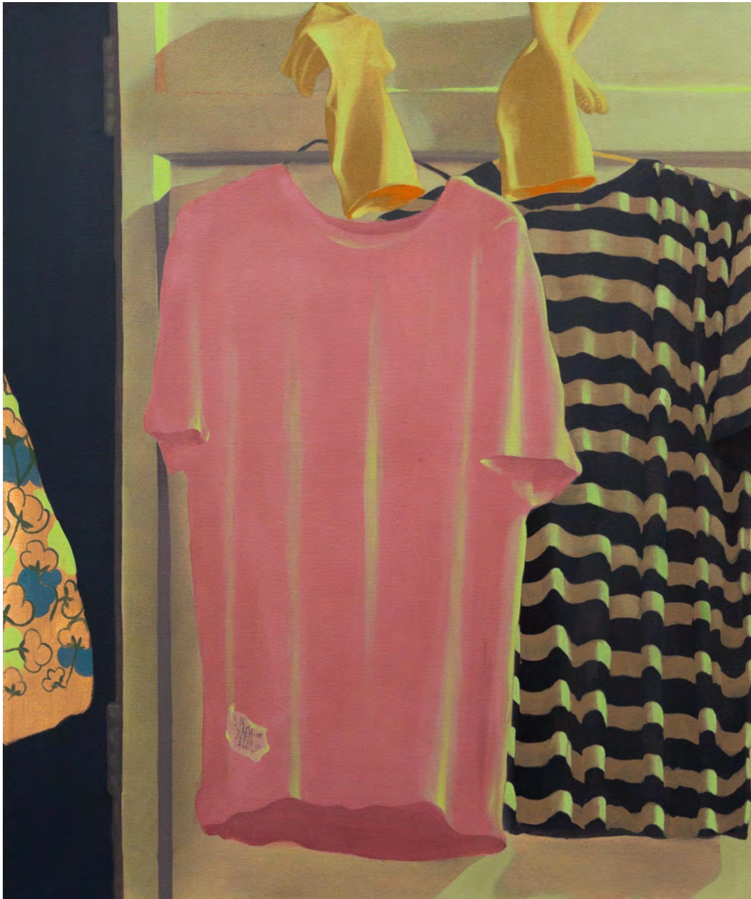
Lakshya Bhargava After Wash 2025 Acrylic on canvas 36 x 30 inches