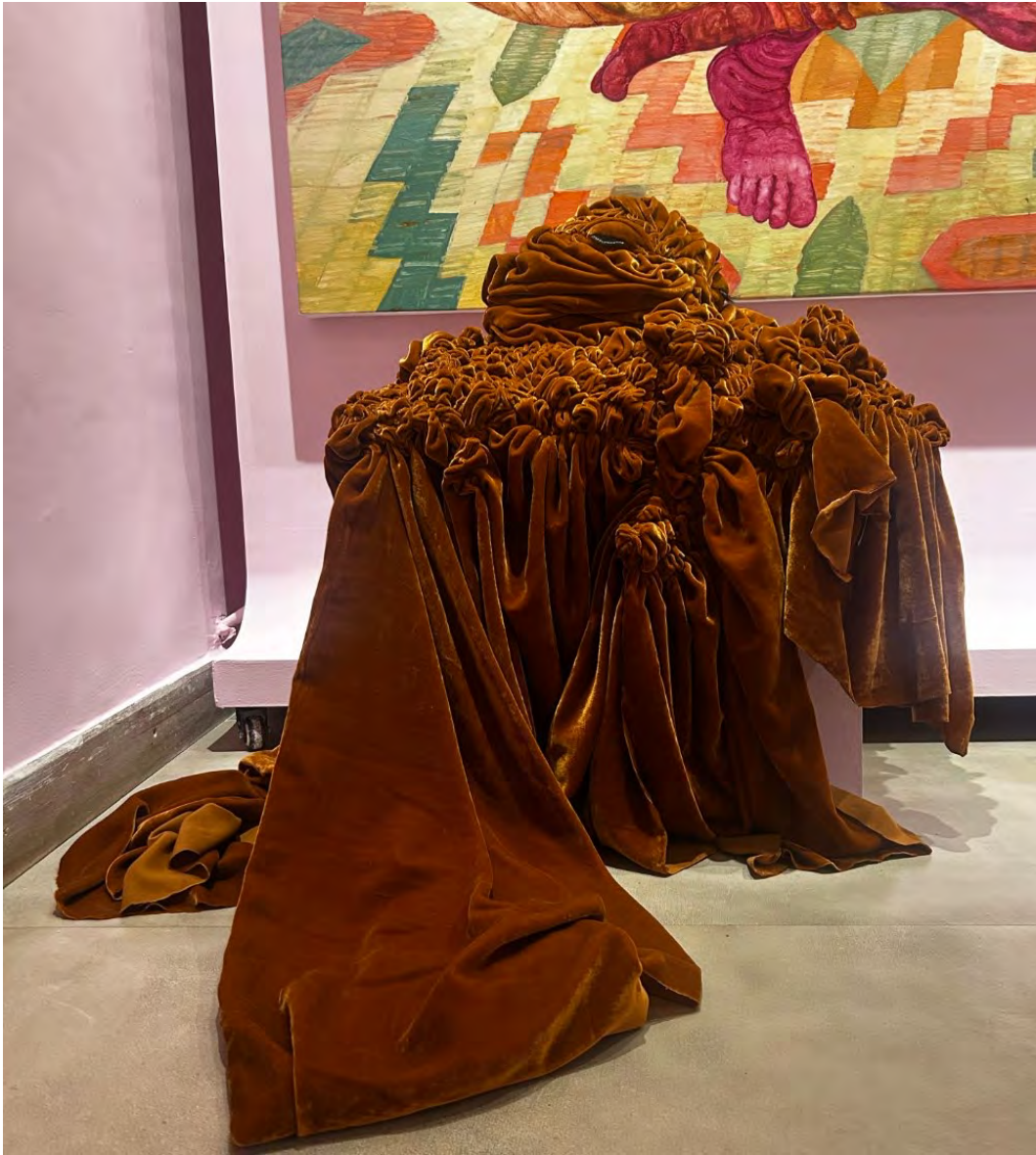
Deepak Dhiman Outcome-ing / shredded skin 2025 Mixed media on canvas + velvet sculpture 60 x 72 inches